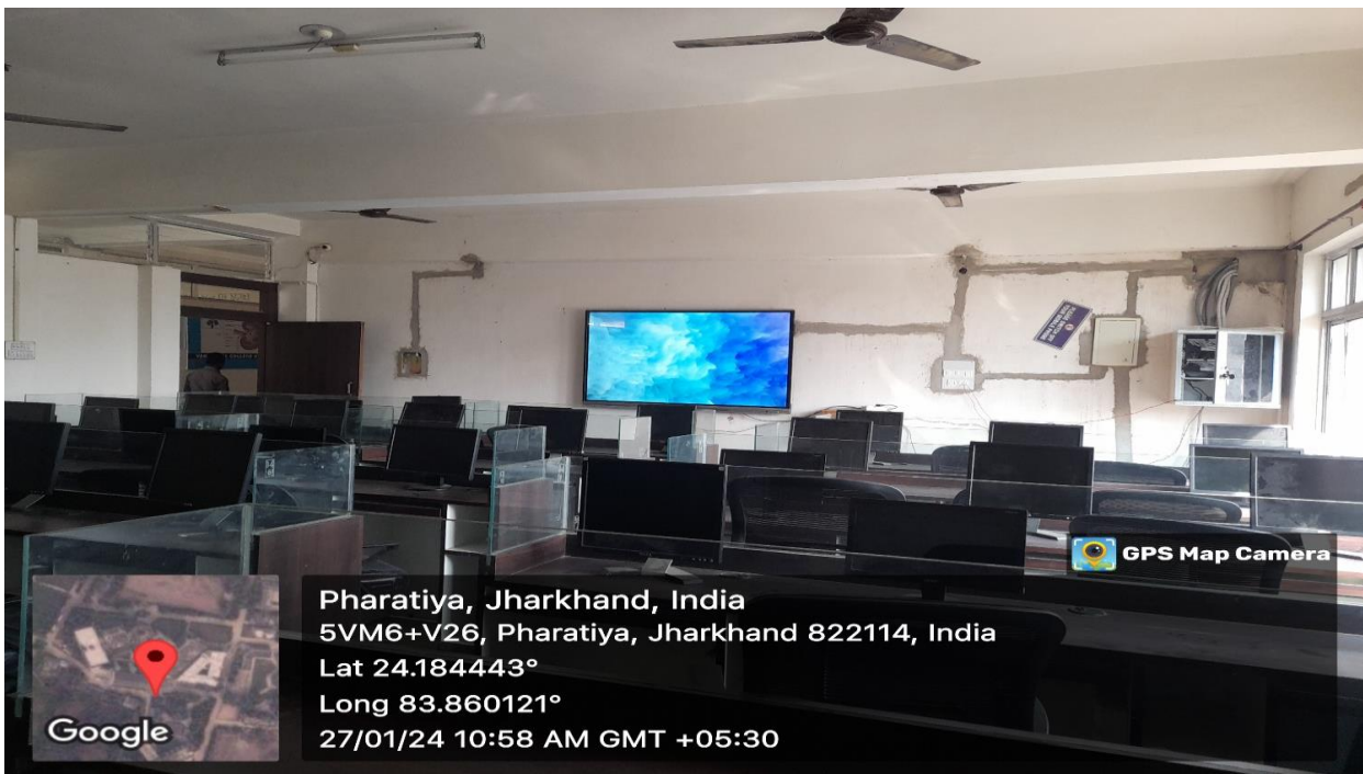
Figure 1- Computer Lab with smart/digital Interactive board