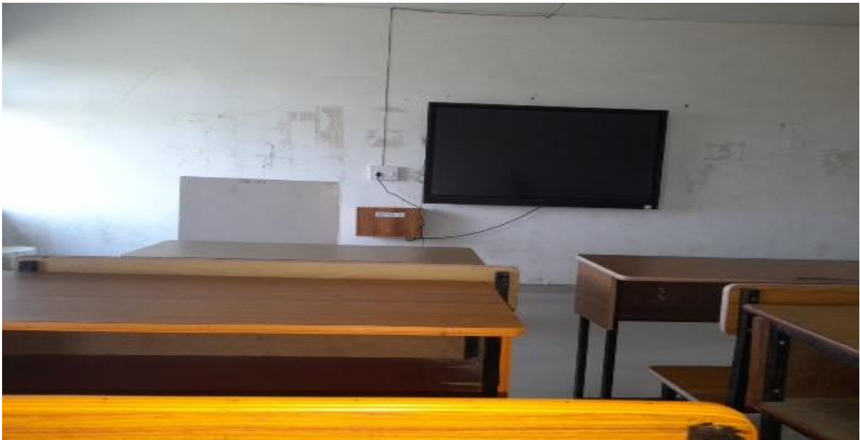
Figure 2- Class room (Smart/Digital Interactive Board) Installed