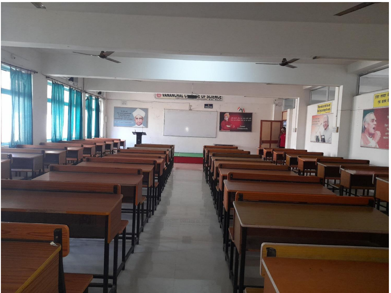
Figure 3- Smart Class Room