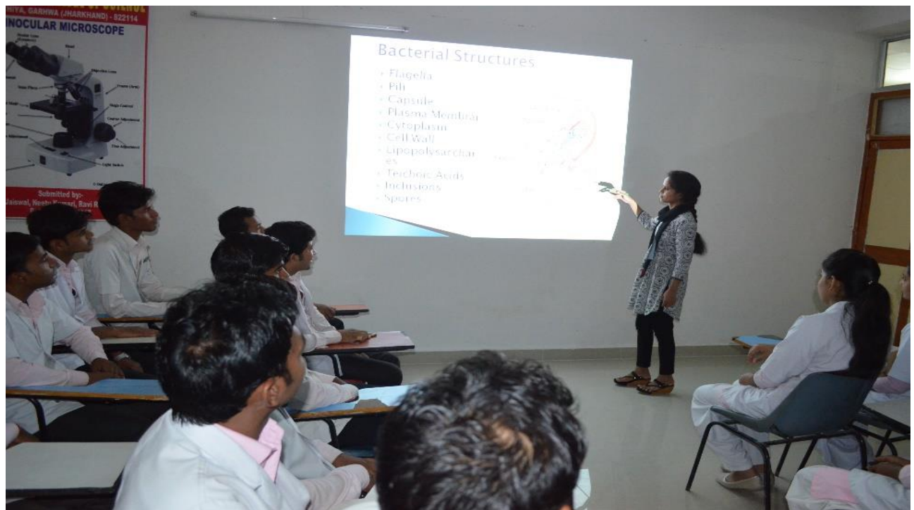
Figure 6- A Powerpoint Presentation