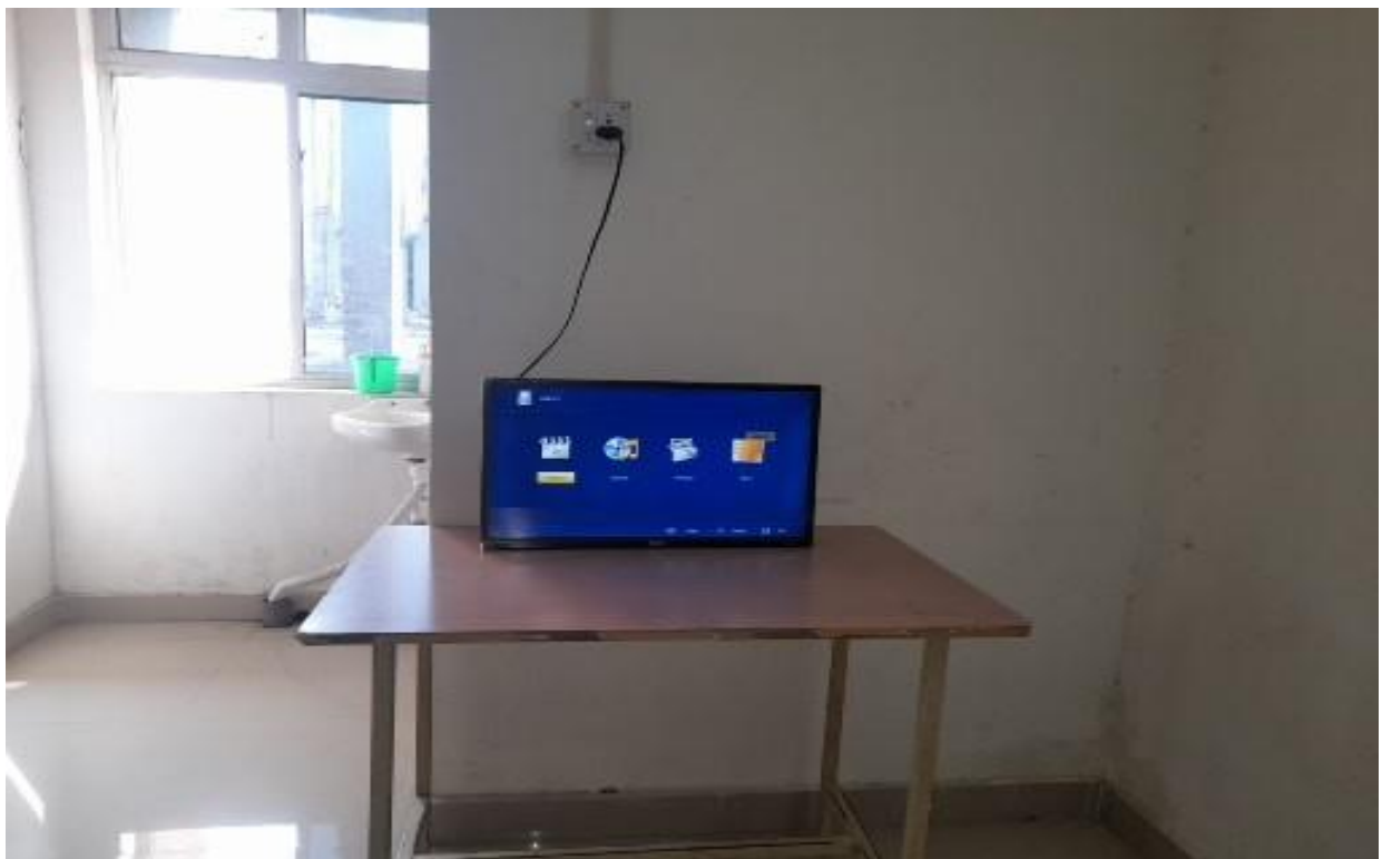
Figure 7- Television in Common Room as a learning resource