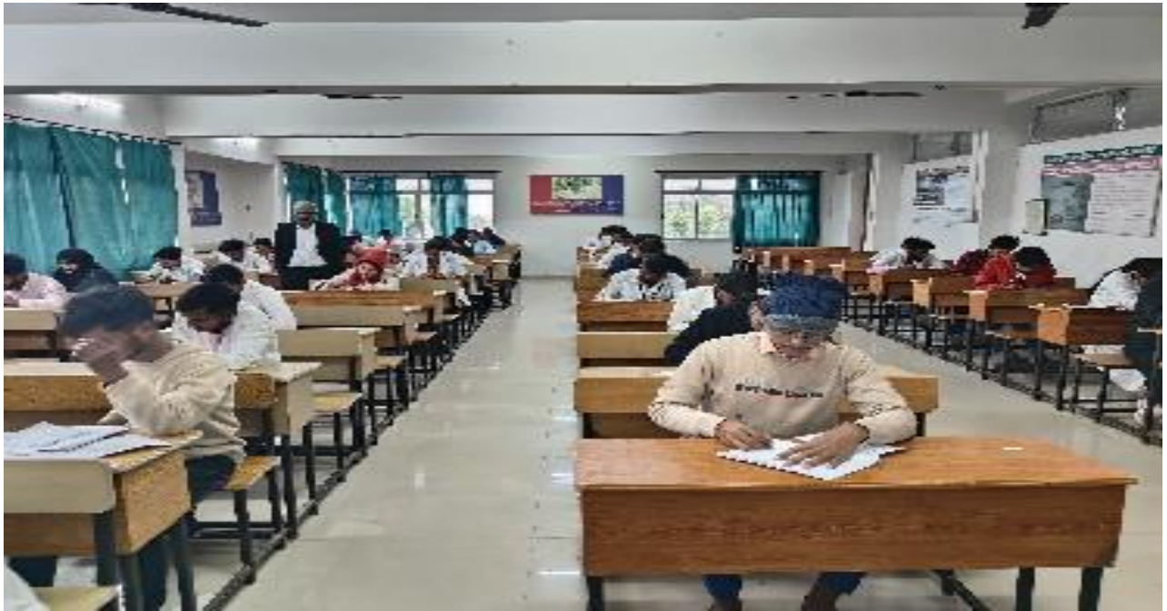
Figure 5- Examination at the V.C.S. Exam Centre