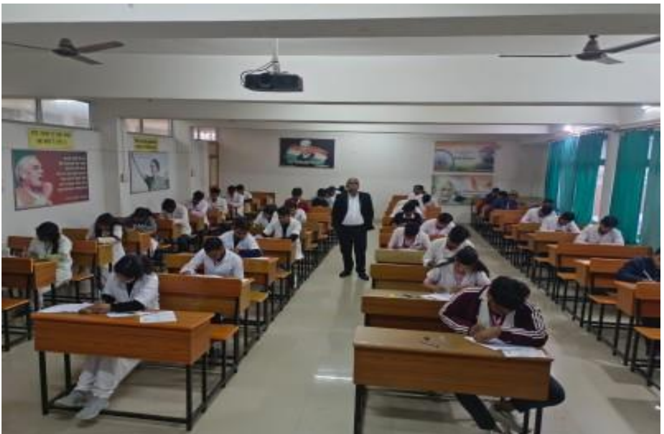
Figure 4- Internal Examination